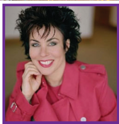
Workshop with Ruby Wax

Visual impairment HIV/ME Diabetes Mindfulness Meditation